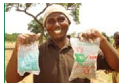
Farmer in Kaduna holding 1 kg bags of Tak Aminchi fertiliser

PrOpCom is working with two Nigerian fertiliser companies: Notore Chemicals Ltd (on a fast-track pilot of farmer training) and TAK Agro & Chemicals Ltd (facilitating the production of a new blend of fertiliser referred to as Tak Aminchi ), as well as in partnership with FIPS-Africa (a non-profit organisation based in Kenya) to implement this market-led initiative. Pilot activities in support of these fertiliser interventions will impact 171,000 poor households, create 55,000 jobs and generate some N1.2 billion (£4.8 million) in increased income.