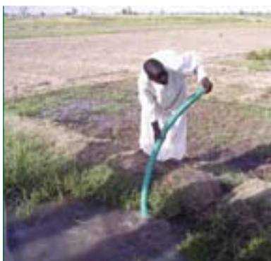
Irrigation farming in Kano

PrOpCom is supporting efforts to improve the agricultural policy environment, both at the national level and in selected states. The programme works with relevant government and private stakeholders to develop supportive policies that will lead to a well-regulated and business-friendly environment. PrOpCom is also providing support for Public-Private Dialogue (PPD) – a platform for addressing market failures in the Nigerian rice economy. These efforts will have a positive impact on approximately 161,000 households and generate more than N4 billion (£16 million) in increased income from an improved business environment, increased stakeholder investment and enhanced private sector participation in the policy process.