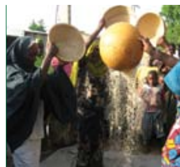
Rice winnowing in Kano