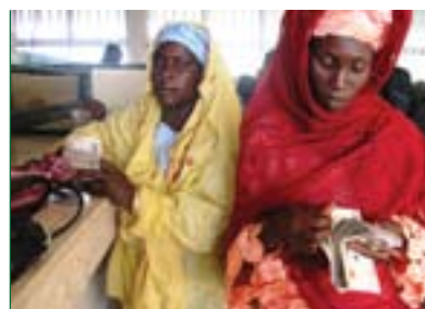
Many rural women do not have access to formal banking systems

PrOpCom is partnering with e-Tranzact (a company offering online real-time payment systems) to facilitate financial services and access for the rural 'unbanked' – mainly farmers and agro-processors in rural areas who have limited access to formal financial services. This will be done using mobile banking (m-banking) products, which allow people without formal bank accounts to benefit from cashless and remote transactions and permit anyone with a mobile phone to make financial transactions. The pilot will impact 25,000 poor households, create 125 jobs and generate N7.5 million (£30,000).